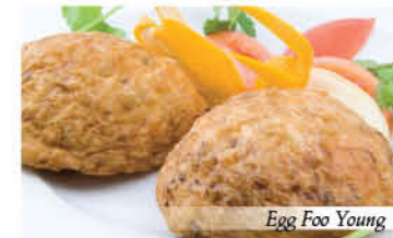
Egg Foo Young