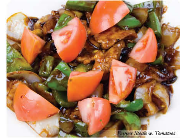
Pepper Steak w. Tomatoes