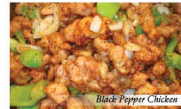
Black Pepper Chicken