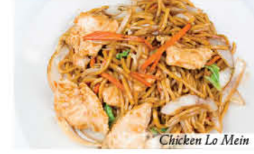
Chicken Lo Mein