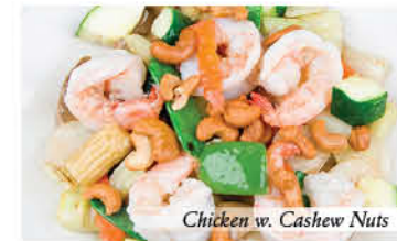
Chicken w. Cashew Nuts