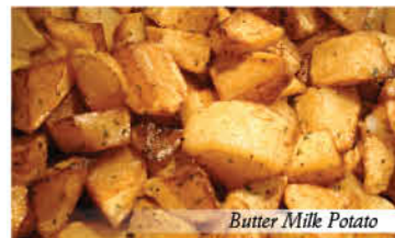
Butter Milk Potato